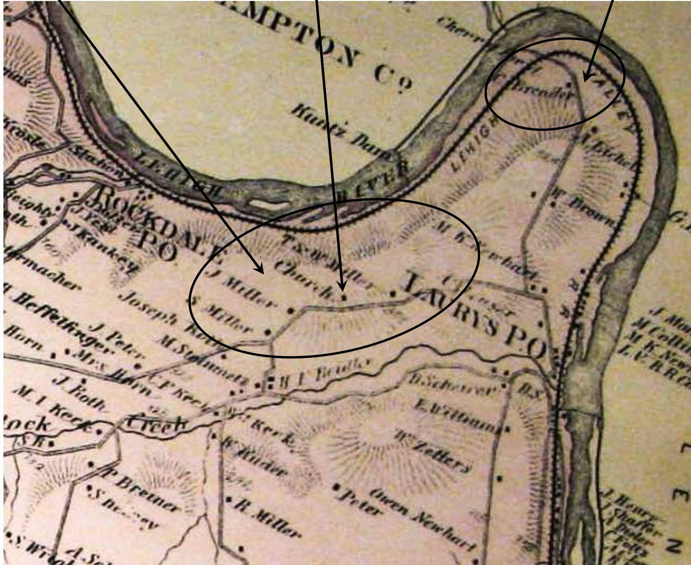
From THE 1876 ILLUSTRATED ATLAS OF LEHIGH COUNTY